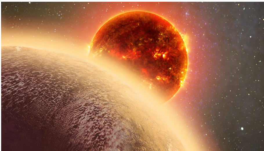
This artist's conception shows the rocky exoplanet GJ 1132b, located 39 light-years from Earth.

evolved over time. Venus probably began with Earthlike amounts of water, which would have been broken apart by sunlight. Yet it shows few signs of lingering oxygen. The missing oxygen problem continues to baffle