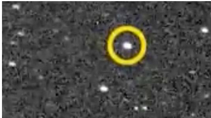
This image still from a video by scientists studying the black hole V404 Cygni located about 7,800 light-years from Earth shows visible light that could be viewable by stargazers with a medium-size telescope.

Astronomers find that activity in the vicinity of a black hole can be observed in optical light at low luminosity for the first time without high-spec